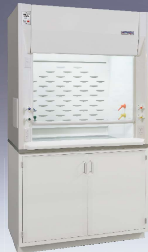
UniFlow LE AirStream