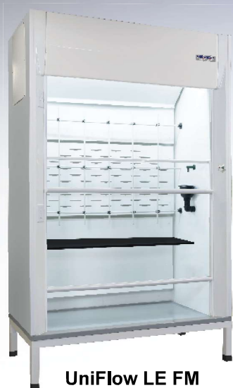
UniFlow LE FM